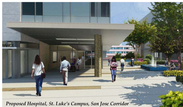
Proposed Hospital, St. Luke's Campus, San Jose Corridor

For the latest information, visit RebuildCPMC.org