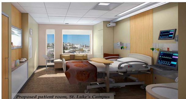
Proposed patient room, St. Luke's Campus

We propose to transform St. Luke's into the hospital of choice for the southern sector of San Francisco, ready to serve both its longstanding patient base and to attract physicians and patients from all nine of the campus' surrounding neighborhoods. Our vision for the future of this campus reflects input from a Blue Ribbon Panel of health care advocates and community leaders, from the San Francisco Health Commission as well as our physicians and staff. We are working with our St. Luke's neighbors on our construction plan.