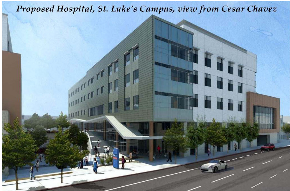
Proposed Hospital, St. Luke's Campus, view from Cesar Chavez

California Pacific Medical Center, which provides health care for more than 40% of San Francisco patients, plans to modernize our system of care while meeting state earthquake safety mandates. We plan to build two state-of-the-art acute care hospitals, one conveniently located at Van Ness and Geary and one at our St. Luke's Campus, and to complete a major renovation at our Davies Campus. Our citywide plan will double the number of earthquake-safe beds in San Francisco, improve privacy and infection control by creating all single-patient rooms, inject $2.5 billion into the economy while creating 1,500 construction jobs, and improve health care access for all San Franciscans. This integrated system of care depends on each component working together to ensure that CPMC can continue to deliver the best care for this and future generations.